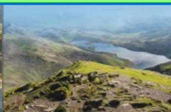
Snowdonia National Park