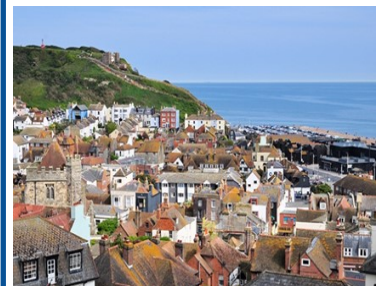
Hastings Town in the UK