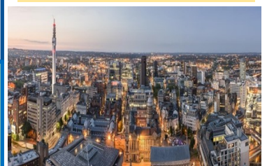
Birmingham City in the UK