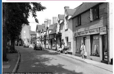
Wombourne Village in the UK