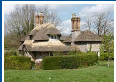
Blaise Hamlet Hamlet in the UK