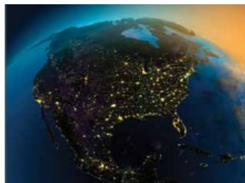
North America and the USA

North America is one of seven world continents. The USA (United States of America) is a country within North America. It is one of the largest countries in the world and is separated into 50 different states.