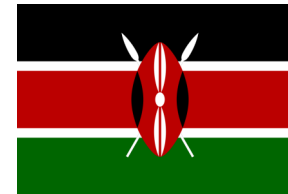
Flag of Kenya