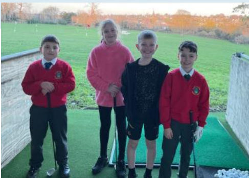
Well done to all who took part.

The children who took part in Golf Club at the Mark Butler Golf Academy enjoyed using the driving range to practise their skills. They especially liked using the Toptracer on the range, which uses advanced ball-tracking to capture real-time data like speed and distance, helping our young golfers to improve their game. We even had some drives over 100 yards!